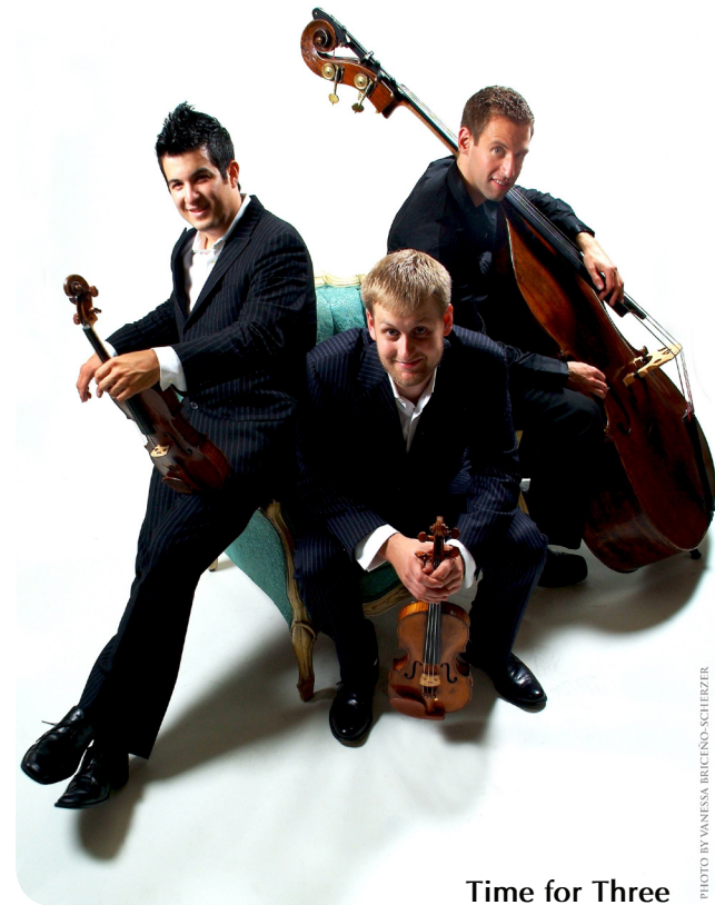
Time for Three

See reverse for additional programming and pricing information.